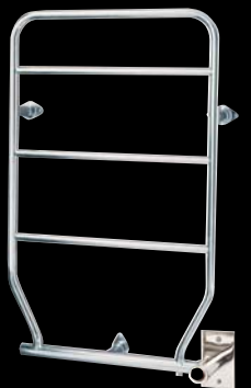
WEO140 CH 34-1/2" h x 23" w