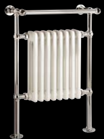
EVR 1 CH 37-5/8" h x 26-5/8" w