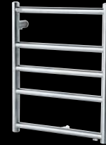
ECMH3-7 CH 21-3/8" h x 17-1/4" w