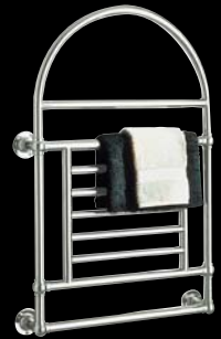
EB29 CH 41" h x 27-1/4" w