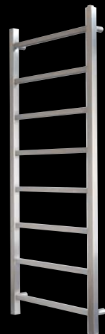
DIV 1 30" h x 20" w