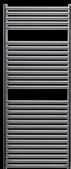
ERR 1 30-9/16" h x 19-3/4" w