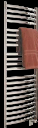
ECM 1 28-3/4" h x 19-5/16" w