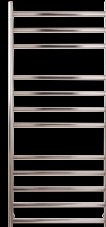
WDIA12 46" h x 20" w