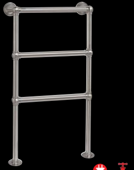
EB24-1 CH 37-5/8" h x 27-1/4" w