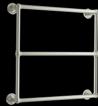
EB34-1 CH 27-1/4" h x 27-1/4" w