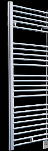
EECOSH-85 33-15/16" h x 19-11/16" w