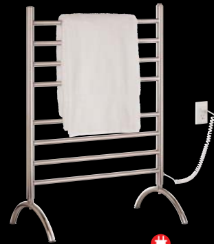
FPRL08 36" h x 24" w