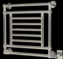
EB31-1 CH 27-1/4" h x 27-1/4" w