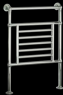
EB27-1 CH 37-5/8" h x 27-1/4" w