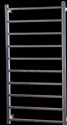
WRBY10 45-3/4" h x 23-5/8" w