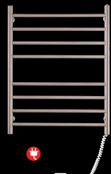
WPRL08 30" h x 24" w