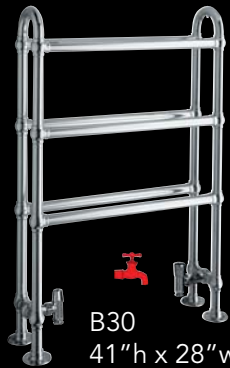
B30 41" h x 28" w