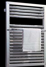
EMR 750 36" h x 24" w