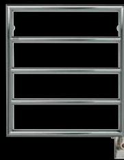
ECMH3-3 CH 21-5/8" h x 19-11/16" w