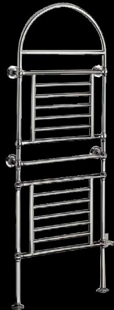
EB49 CH 73-1/2" h x 27-1/4" w