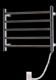
WDIA05 16-3/4" h x 20-1/4" w