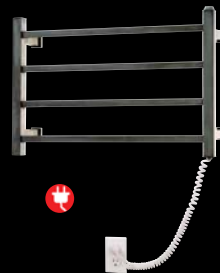
WRBY04 15-3/4" h x 23-5/8" w