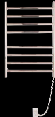
WDIA08 30" h x 20" w