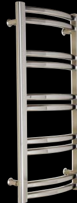
ECMH3-2 CH 35-1/4" h x 17-1/4" w